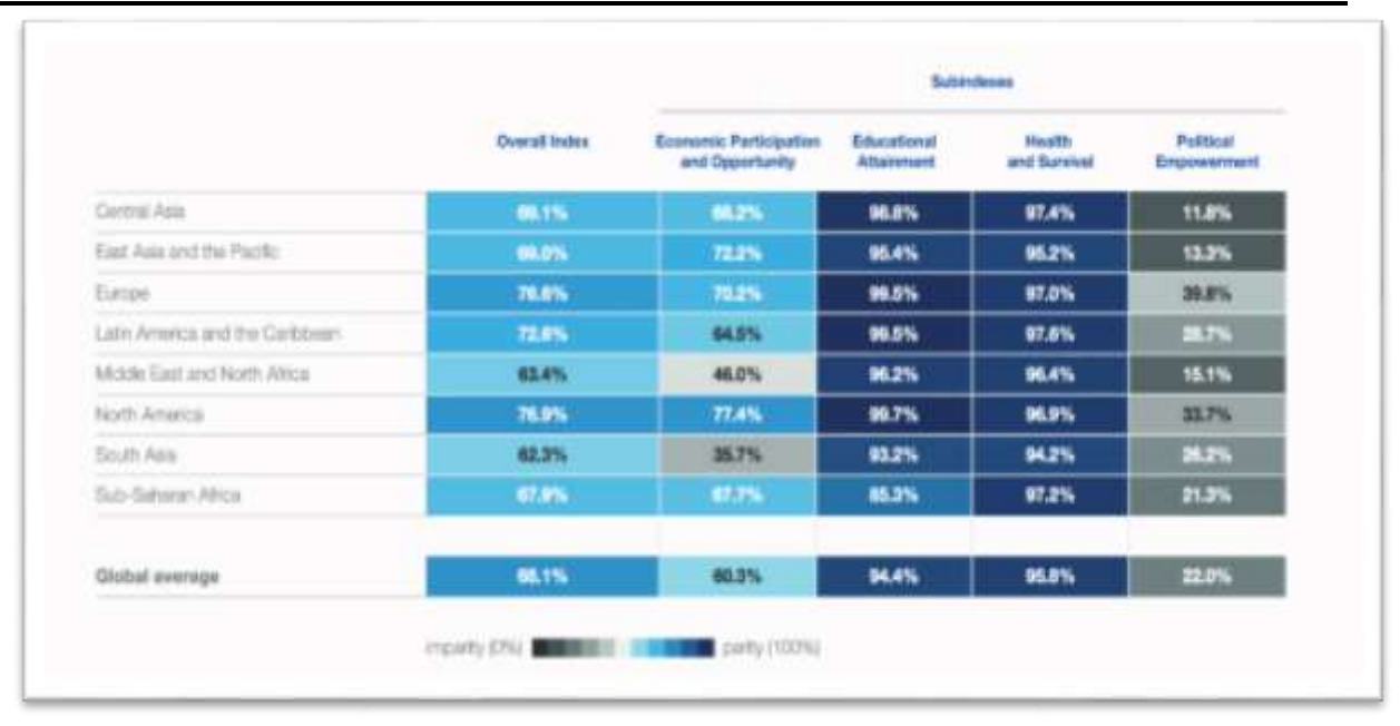
Figure 3 Gender gap closed to date, by region (Global Gender Index 2022, World Economic Forum)

Gender equality is a comprehensive concept that encompasses economic, social, and political empowerment. SAARC encounters numerous obstacles in fostering cooperation and collaboration among its constituent nations. According to statistics issued by the World Economic Forum (WEF) in their Global Gender Gap report for 2022, the gender disparity figures for SAARC countries were the lowest among the other regions. The data is presented in the GGI report (2022) figure below.